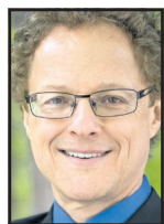
KOTZER Wills lawyer

Revenge is sometimes a dish best served from the grave.